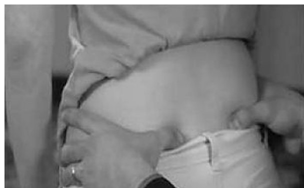
Figure 5. Palpation of the posterosuperior iliac spine.

Hypothesis 1 was that there was no relationship between VAR2 (abnormal foot pronation) and VAR3