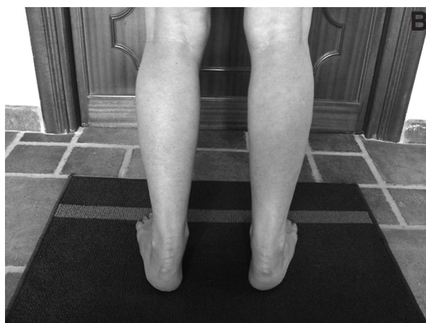
Figure 3. Modified stance position. (A) The patient stands in a forward lean position with the body's weight over the inner longitudinal arch. (B) The feet are placed by the subject in a comfortable position as close to their natural base and angle of gait as possible.

this study); and 3) individual differences between subjects could generate random errors (all of the subjects were taken from a genotypically homogenous population).