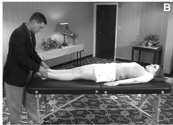
Figure 4. Pelvic thrust maneuver. With the subject supine, the relative positions of the medial malleoli are visually compared (not shown). A, With knees flexed and feet flat on the table, the subject lifts the pelvis from the table. B, With the subject returning the pelvis to the table, the subject's knees are passively extended. The relative positions of the medial malleoli are again visually compared. This maneuver is used to facilitate pelvic symmetry. If this maneuver eliminates an apparent leg-length difference, a functional leg-length discrepancy is diagnosed. If this maneuver does not eliminate an apparent leg-length difference, an anatomical leg-length discrepancy is suspected. (From the CD-ROM accompanying Baxter RE, Musculoskeletal Assessment , p 146, Elsevier, New York, Copyright 1998. Reprinted with permission from Elsevier.)

with a Foot Posture Index score greater than 2 were included in this study. Redmond et al 26 investigated the validity of the Foot Posture Index scores using the Cronbach \alpha reliability coefficient. All of the components of the Foot Posture Index proved to be acceptable predictors of the total Foot Posture Index score. This provided a quantitative assessment of which foot was more pronated.